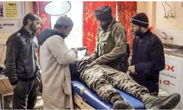
rushed to a nearby hospital, where he is undergoing treatment, they added.

Srinagar: A CRPF jawan was injured after a leopard attacked him at a camp of the paramilitary force in Jammu and Kashmir’s Anantnag district on Wednesday, officials said. The leopard strayed into the CRPF camp in Kapran area of Verinag in south Kashmir while personnel were having breakfast in the mess, they said. The animal attacked one jawan before fleeing into the nearby forest, the officials said. The injured jawan was